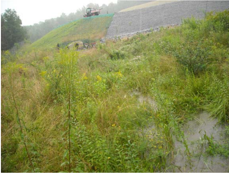
Picture 8: View of discharge channel looking toward outlet structure from Site discharge point near HV-1