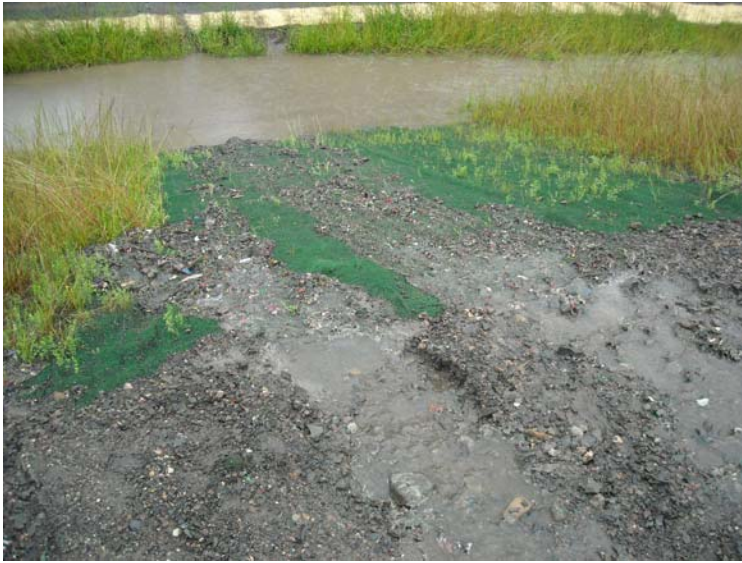
Picture 1: Battery casings, sediment, and debris washed over CA berm