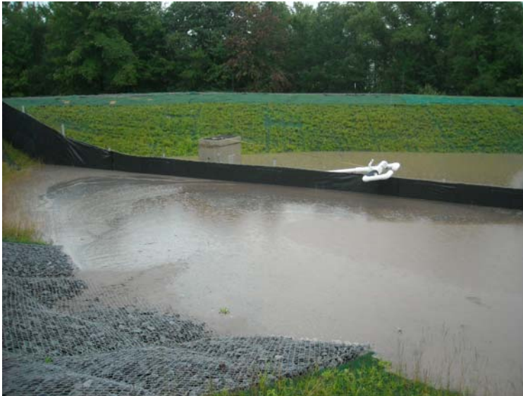
Picture 4: View of Sediment Basin and outlet structure. Skimmer was raised above waterline prior to storm event.