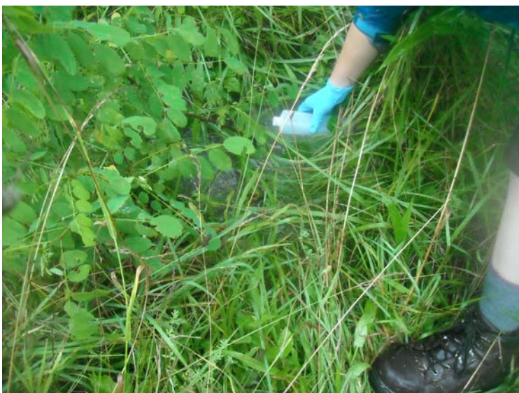
Picture 6: Discharge sampling location for total and dissolved lead (outside of fence line, southwest corner of Site)